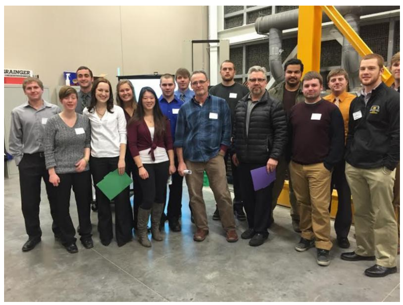
Students, Staff and Duluth Grill staff

The student groups participated in site assessments with utilities, and are now writing up plans to present to the businesses at the end of April.