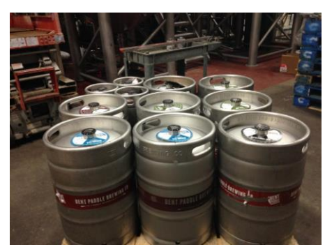
Bent Paddle Brewing Kegs